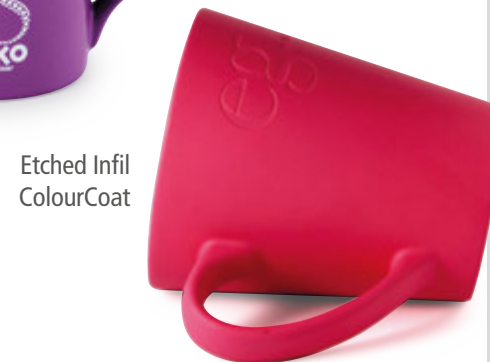
Etched Infil ColourCoat